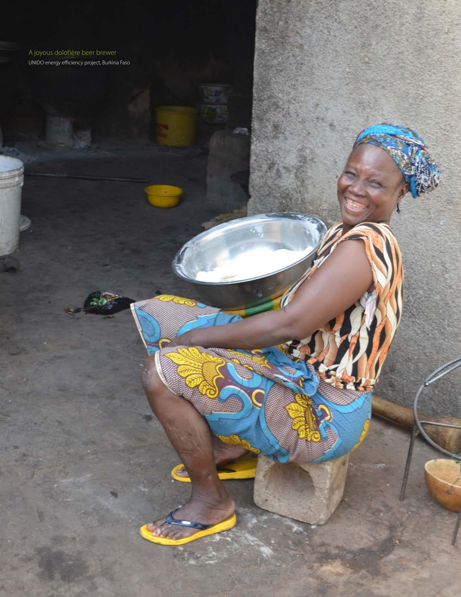
A joyous dolotière beer brewer UNIDO energy efficiency project, Burkina Faso